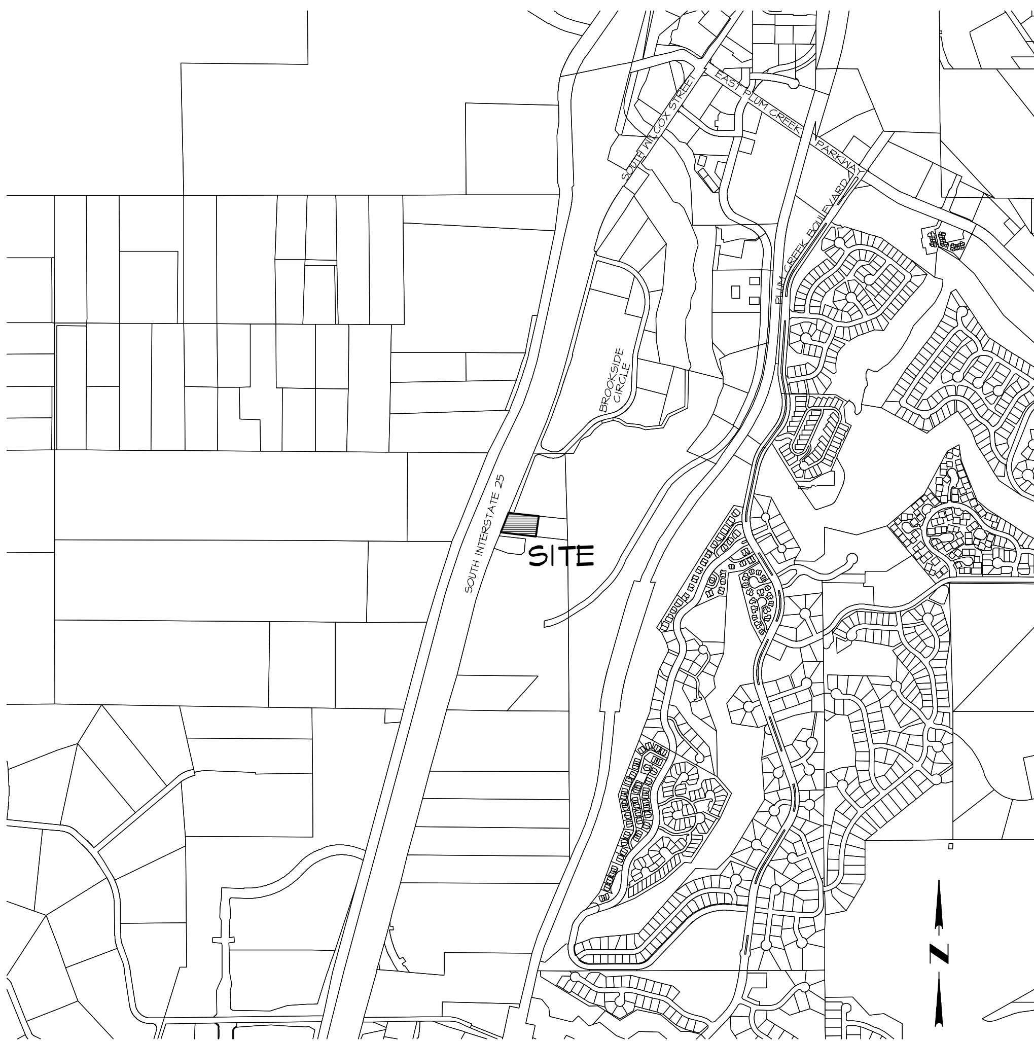
VICINITY MAP 1"=1000'

COMMENCING AT THE NORTHEAST CORNER OF SAID SOUTHEAST 1/4; THENCE SOUTHERLY ALONG THE EAST LINE OF SAID SOUTHEAST 1/4 A DISTANCE OF 678.00 FEET; THENCE NORTHWESTERLY ON AN ANGLE TO THE RIGHT OF 96 DEGREES 34 MINUTES 15 SECONDS A DISTANCE OF 309.60 FEET; THENCE SOUTHWESTERLY ON AN ANGLE TO THE LEFT OF 89 DEGREES 14 MINUTES 30 SECONDS A DISTANCE OF 102.23 FEET TO THE TRUE POINT OF BEGINNING; THENCE NORTHWESTERLY ON AN ANGLE TO THE RIGHT OF 84 DEGREES 14 MINUTES 30 SECONDS A DISTANCE OF 315.58 FEET TO THE EAST LINE OF INTERSTATE NO. 25; THENCE SOUTHERLY ON AN ANGLE TO THE LEFT OF 73 DEGREES 39 MINUTES 00 SECONDS ALONG SAID EAST LINE A DISTANCE OF 103.69 FEET; THENCE SOUTHEASTERLY ON AN ANGLE TO THE LEFT OF 106 DEGREES 21 MINUTES 00 SECONDS A DISTANCE OF 334.74 FEET; THENCE NORTHEASTERLY ON AN ANGLE TO THE LEFT OF 84 DEGREES 14 MINUTES 30 SECONDS A DISTANCE OF 100.00 FEET TO THE POINT OF BEGINNING, COUNTY OF DOUGLAS, STATE OF COLORADO.